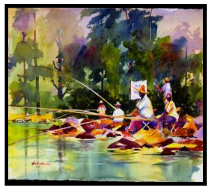
Wed. and Sat. mornings 1650 ART MUSEUM DR. JACKSONVILLE, FL.

Wed. Afternoon we have Drawing secessions from 1:30 to 4:30